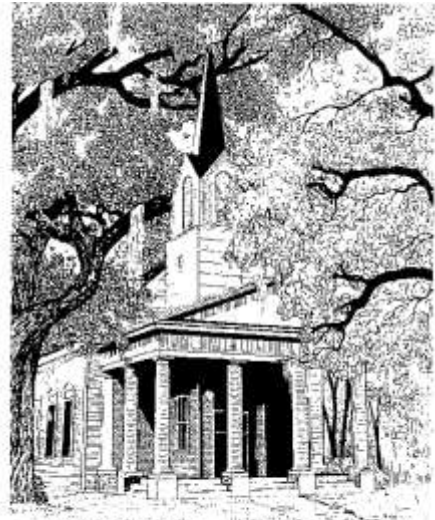
New Wappetaw Presbyterian Church McClellanville, SC

New Wappetaw Presbyterian Church 635 Pinckney Street McClellanville, SC 29458 PO Box 460 nwpconline.org 843 887-3953